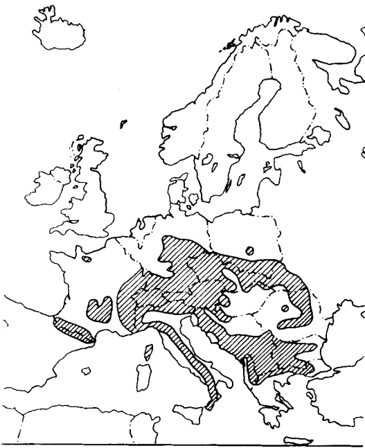
Fig. 1. Distribution of A. alba in Europe.

areas, and that this region could not be origin of the western or central European A. alba populations. More recently, VICARIO et al. (1995) have found a higher level of allozyme and DNA variation in the southern A. alba populations than in populations from the other parts of Italy.