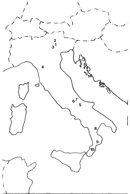
Fig. 2. Location of the investigated A. alba populations in Italy.

Winter buds were collected from ten natural populations of A. alba throughout the Alps and the Apennines chain. The geographical origin of the investigated populations and their coordinates are presented in Fig. 2 and in Table 1. The collections included three populations from the Alps (Trentino Alto Adige region), one population from the northern part of the Apennines chain (Toscana region), three populations from the central part of